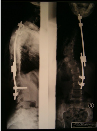
Figure 1 Lateral and postero-anterior spinal films after implantation of growing-rods.